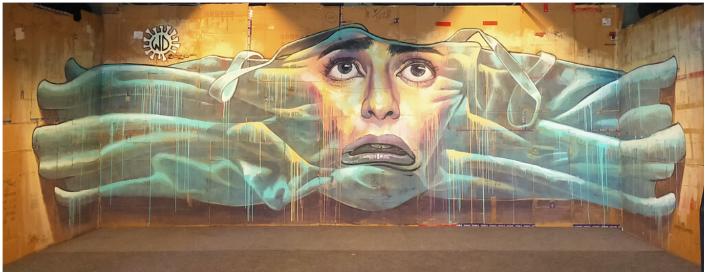
Artwork by : @wd_wilddrawing